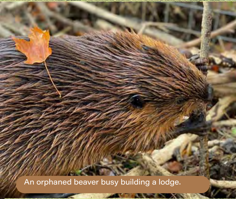
An orphaned beaver busy building a lodge.

We provided care for 91 orphaned and injured animals in 2021. Sixty-five were returned to the wild. We also fielded many wildlife related calls and helped get animals to other people who could help them.