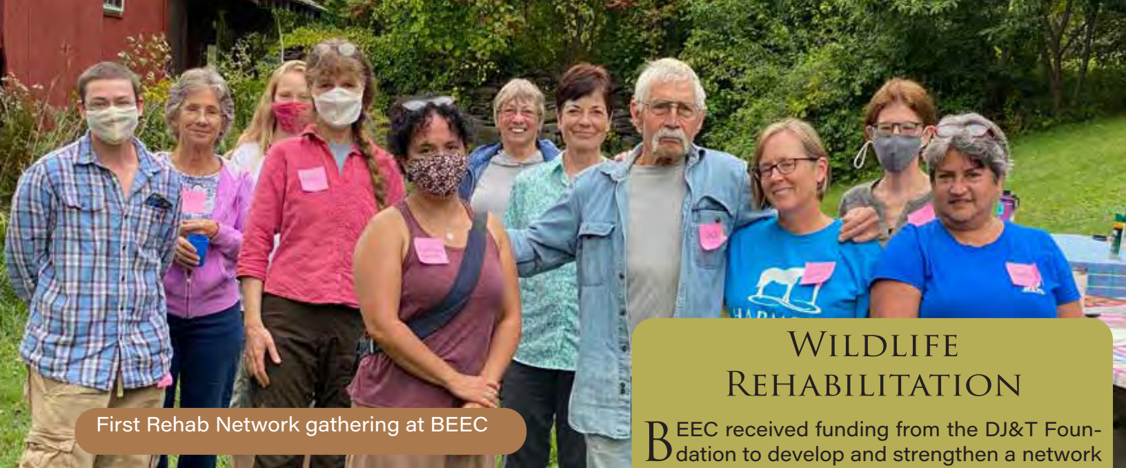
First Rehab Network gathering at BEEC